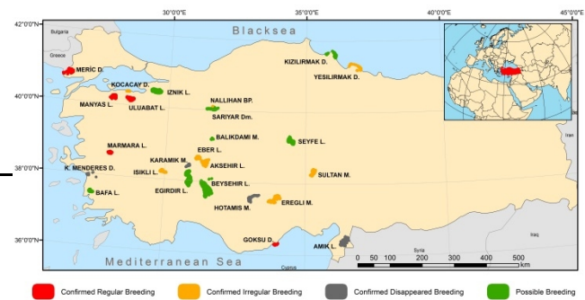
Figure 1. Current and historical breeding distributions of breeding Glossy Ibises in Turkey.